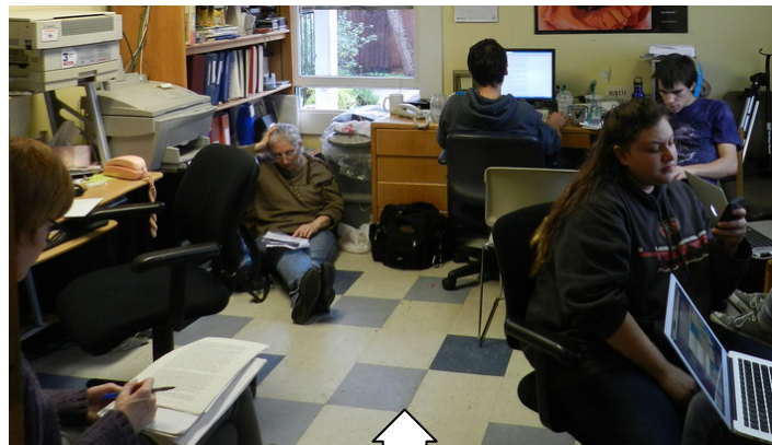
Thesis committee members are hard at work reviewing draft theses to provide candidates feedback in time for the graduation deadline.

A student had to stay home sick, but participated in the Spanish class via FaceTime (see the face in the phone?)